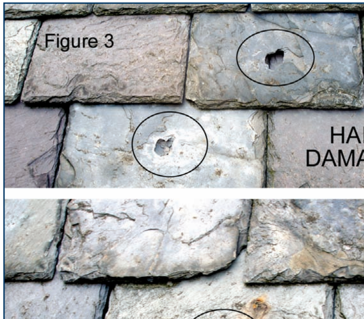
Figure 3 – Hail-perforated slates should simply be removed and replaced. Hail damage rarely justifies replacement of an entire slate roof.