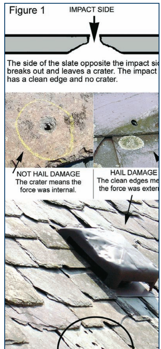
Figure 1 - When slate is perforated, the impact leaves a clean hole on the impact side and a cratered hole on the opposite side of the impact.

Another way to assess the amount of hail impact on a roof is to examine the metal components for indentations. For example, Figure 2 illustrates hail impact indentations on low-slope copper roofs after severe hail events. These roofs are in New Orleans and Chicago. Figure 3 illustrates hail damage to a graduated slate roof in Indianapolis. Although the slates were 1/2 in to 3/4 in thick Vermont slates only 75 years old, some were perforated by huge hailstones.