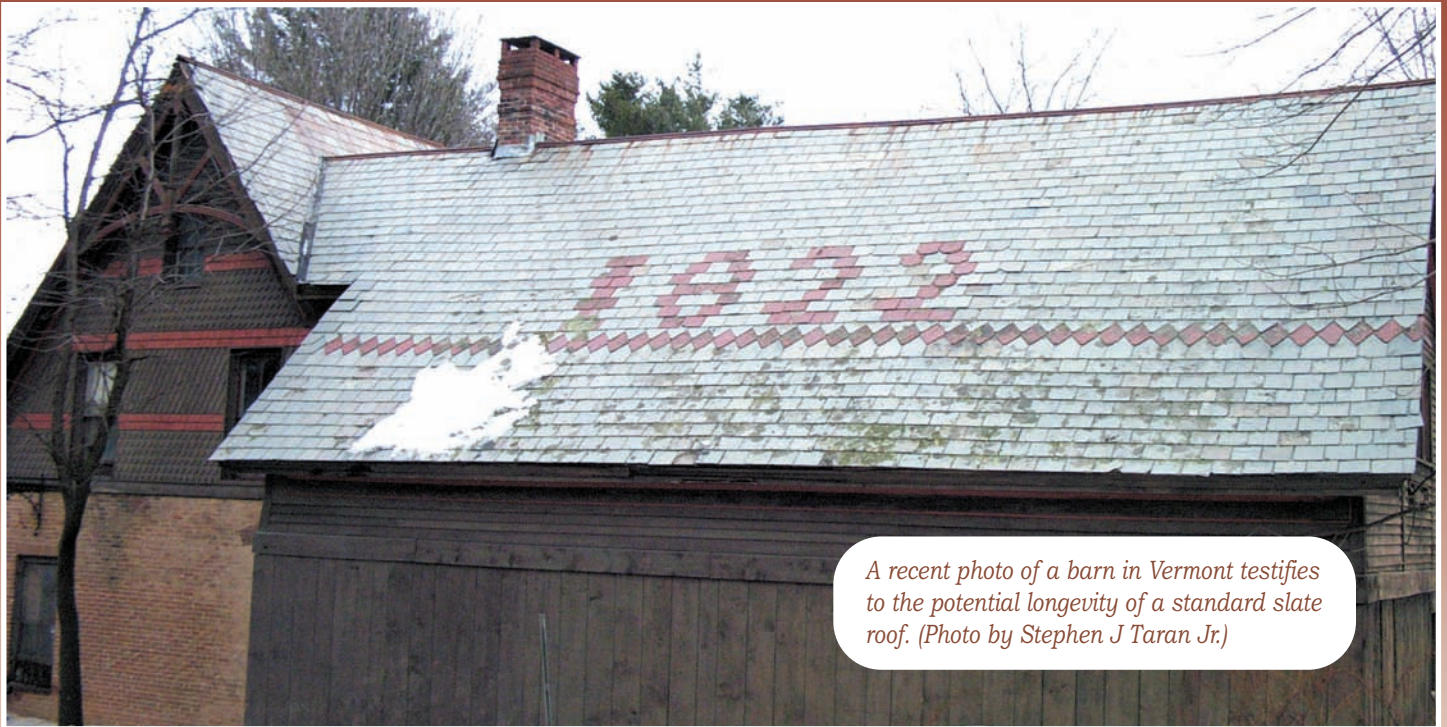
A recent photo of a barn in Vermont testifies to the potential longevity of a standard slate roof.