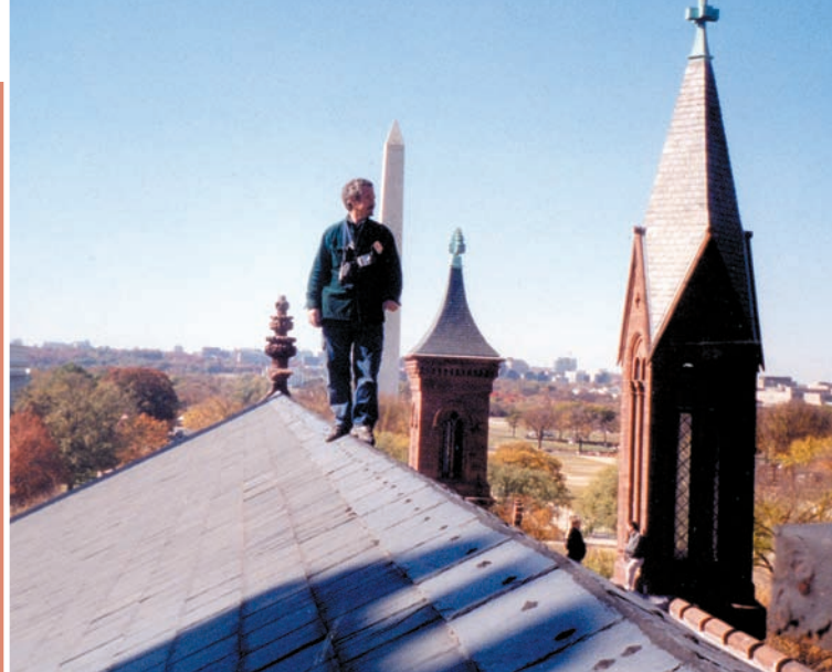
The Smithsonian Institute Building known as "The Castle" had already been replaced with new slate, but some of the original flashings had been left in place, and they leaked. The author is inspecting the roof in the photo above.

refurbished around the time of the bicentennial in 1976. At about that time, the Castle got a new roof. For some unknown reason, however, not all of the Castle's flashings had been replaced. Four main central valleys and the flashings along two parapet walls had been left as original, and they now leaked. Furthermore, the maintenance crew had the habit of tromping on the slate roof in what appeared to be combat boots, crunching the slates underfoot, breaking them, and adding to the roof problems. The solutions were simple and relatively inexpensive: replace the old flashings with new copper and keep people off the roof who don't belong there.