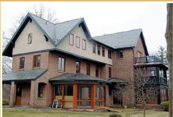
Ten-year-old slate roof on a private residence condemned by roofing contractors. The nominal snow guard damage, however, was covered by homeowner's insurance; the roof did not need to be replaced at all.