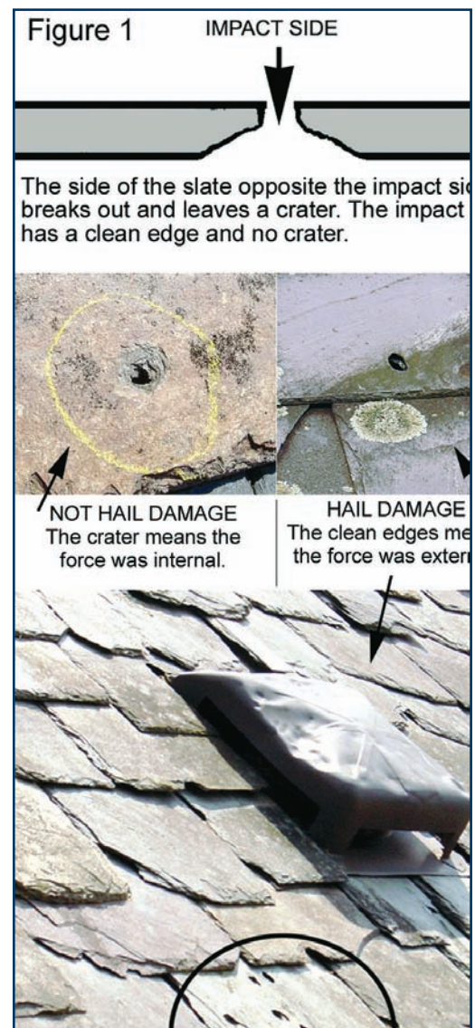
Figure 1 - When slate is perforated, the impact leaves a clean hole on the impact side and a cratered hole on the opposite side of the impact.

Another way to assess the amount of hail impact on a roof is to examine the metal components for indentations. For example, Figure 2 illustrates hail impact indentations on low-slope copper roofs after severe hail events. These roofs are in New Orleans and Chicago. Figure 3 illustrates hail damage to a graduated slate roof in Indianapolis. Although the slates were 1/2 in to 3/4 in thick Vermont slates only 75 years old, some were perforated by huge hailstones.